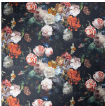
CREATION in Overjoy

275cm. 100% cotton. 25 000 rubs. Multi-directional. Pre-shrunk and double-washed. Dye-lot variations may occur.