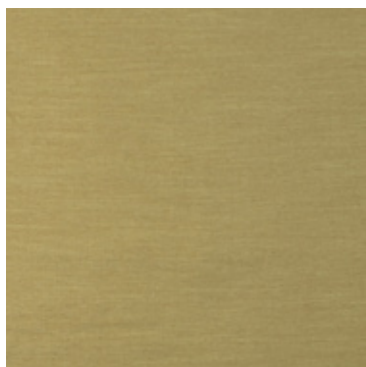
MILANO in Citron