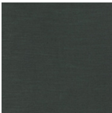
MILANO in Onyx