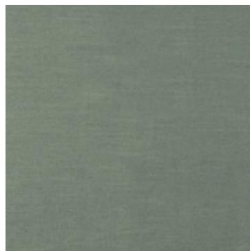
MILANO in Tide