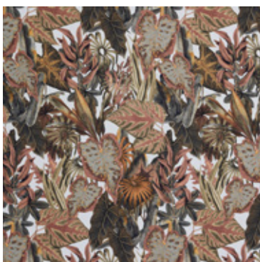
EQUATORIAL in Autumn Hues