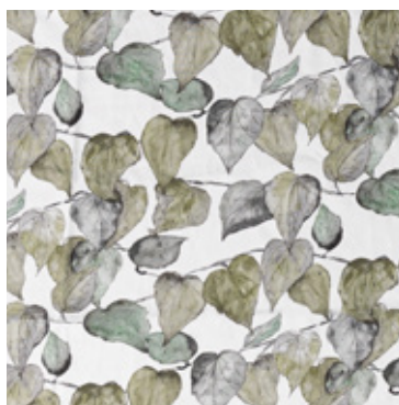
FOLIA ETCH in Greenery