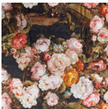
PARADISE in Summer Blush

295cm. 70% viscose; 30% linen. 20 000 rubs. Down-the-roll pattern. Pattern does not repeat horizontally. Pre-shrunk and double-washed. Dye-lot variations may occur.