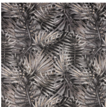
AMELIE in Autumn