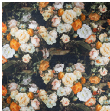
BELLE FLEUR in Topaz