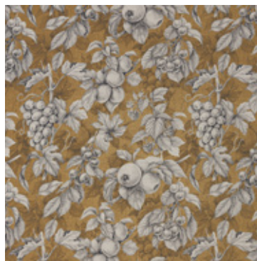
TEMPTATION in Golden Touch

280cm. 90% cotton; 10% linen. 30 000 rubs. Down-the-roll pattern. Pre-shrunk and double-washed. Dye-lot variations may occur.