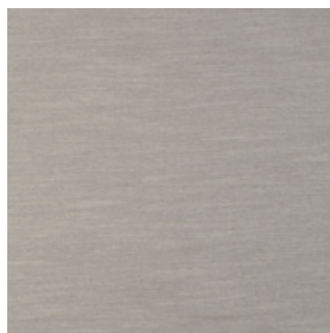
MILANO in Diamond