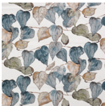
FOLIA ETCH in Winter