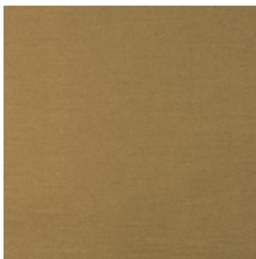
MILANO in Topaz