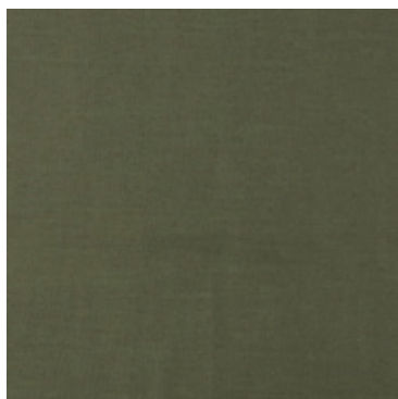
MILANO in Cypress