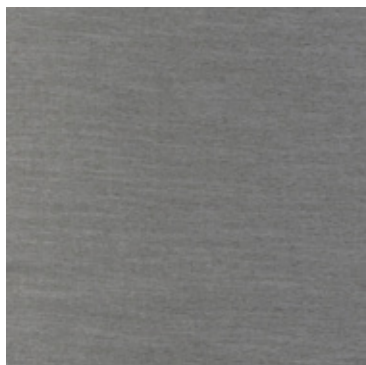
MILANO in Granite