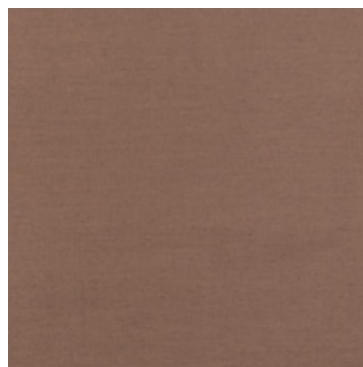
MILANO in Rose Quartz