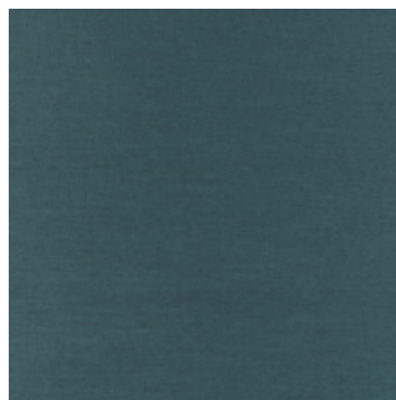
MILANO in Naval

290cm. 65% polyester; 25% viscose; 10% linen. Exceeds 30 000 rubs. Down the roll. Suitable for slipcovers. Pre-wash recommended. Dye-lot variations may occur.