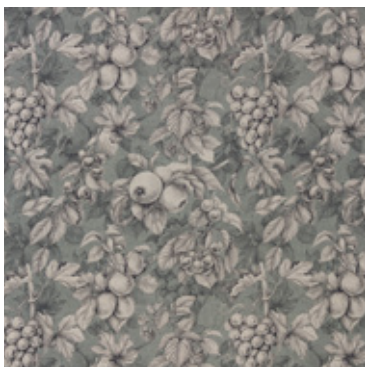
TEMPTATION in Moon Mist