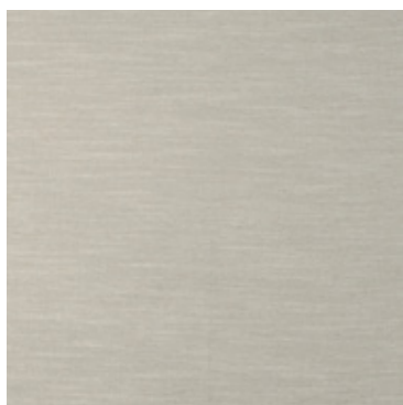
MILANO in Crystal