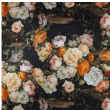
BLISSFUL in Autumn Hues