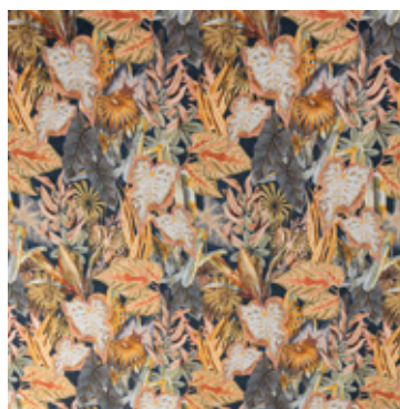
EQUATORIAL in Topaz

277cm. 100% cotton. 25 000 rubs. Down-the-roll pattern. Pre-shrunk and double-washed. Dye-lot variations may occur.