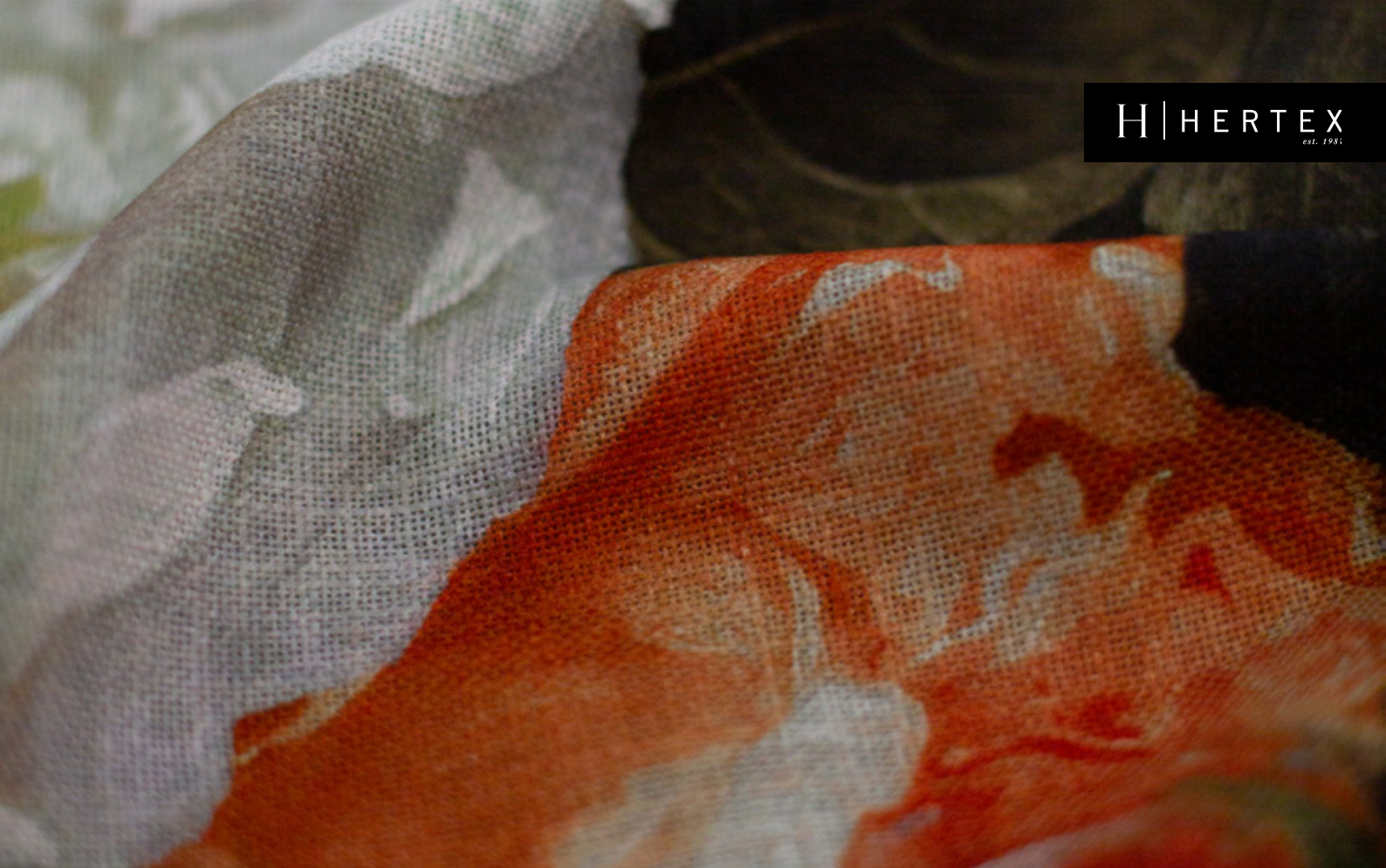
BLISSFUL in Autumn Hues