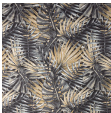
AMELIE in Greenery