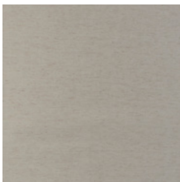
MILANO in Sand Dew