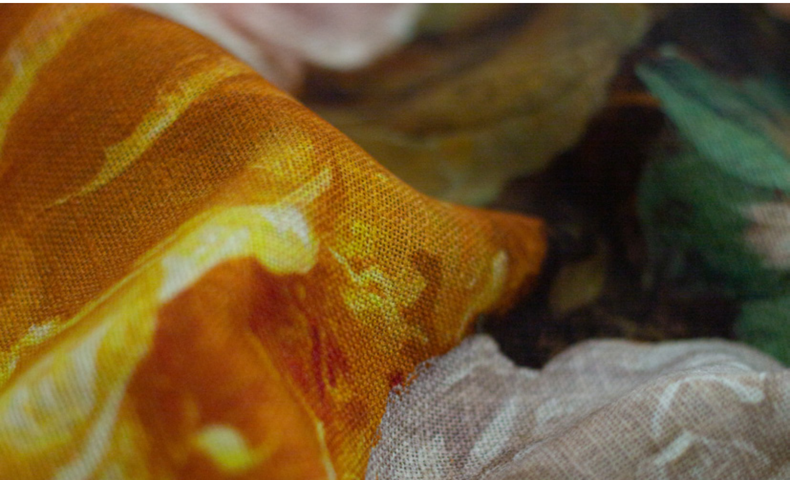
PARADISE in Summer Blush