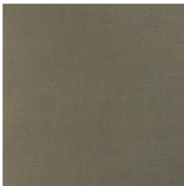
MILANO in Peridot